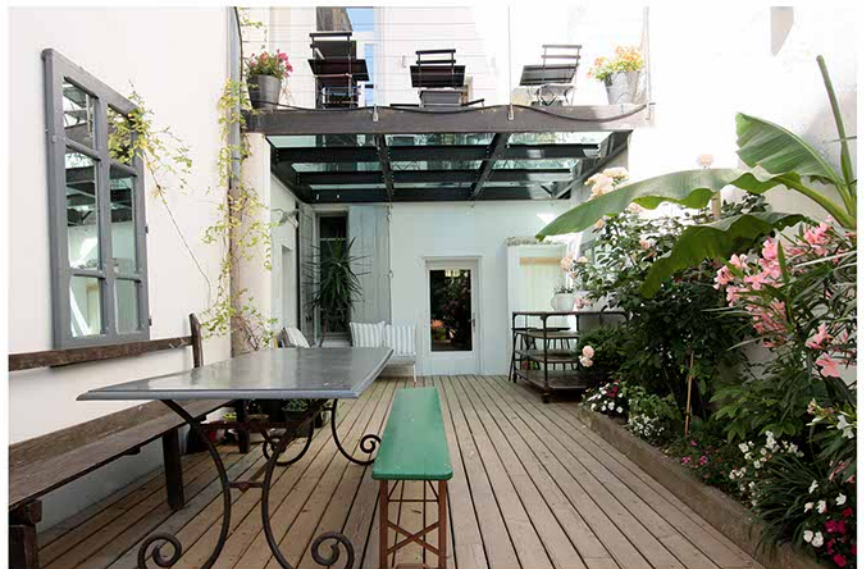
The patio - view from the private garden of the house

On the rooftop you can enjoy a sun bath, a lunch or a very french apéritif before dinner with one of the best view of the Roman amphitheater, or as the locals call it «Les arènes». The skyline of Arles is all yours from here and I am not even talking about the sunsets :)